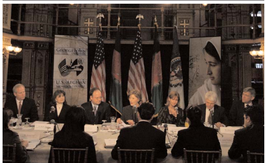
Council meeting at Georgetown, 2008.